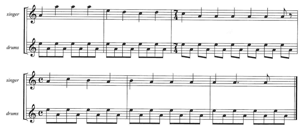
Example 2. Steady descent on an octave

Lots of Dakota melodies descend an octave from A' to A without an interruption by long notes, repeated notes or longer breaks. The second half of the melody usually shows a descent from D or E. (Ex. 2)