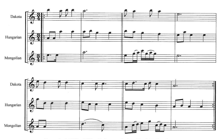
Example 6. Fifth-shifting Dakota melody with A'-E-C cadences (26-2) – Hungarian variant (18-018) – Mongolian parallel (MO1-94)