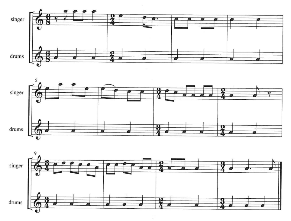
Example 3. Two-section melody with repeated C cadence note (5-14)