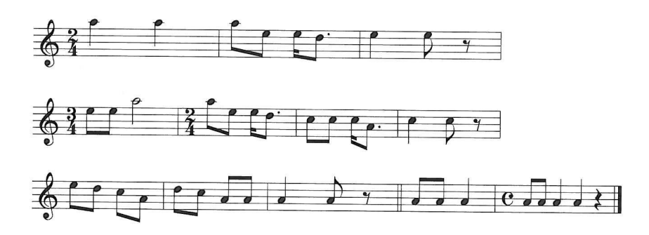
Example 4. Three-section melody with E-C-A cadences (18-15)

Often accurate E and C (or E and D) repeated cadence notes divide the octave-descent into three balanced parts. (Ex. 4)