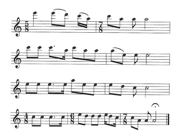
Example 7. Melodies with large range: four-section melody with A'-E-C-A cadences (23-9)

There are a limited number of Dakota melodies with a range wider than an octave. <sup>21</sup> As an example I show a four-sectioned melody with A'-E-C-A cadences ( Ex. 7 ).